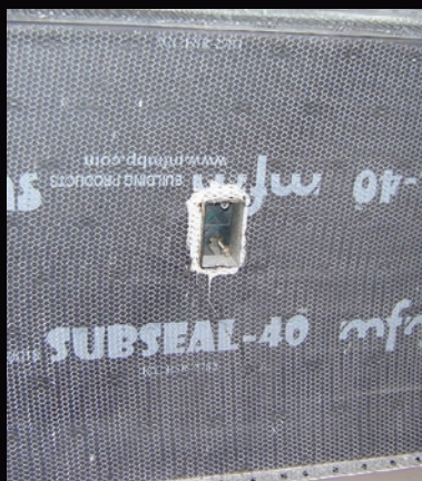
Apply polyurethane sealant when terminating all exterior penetrations.