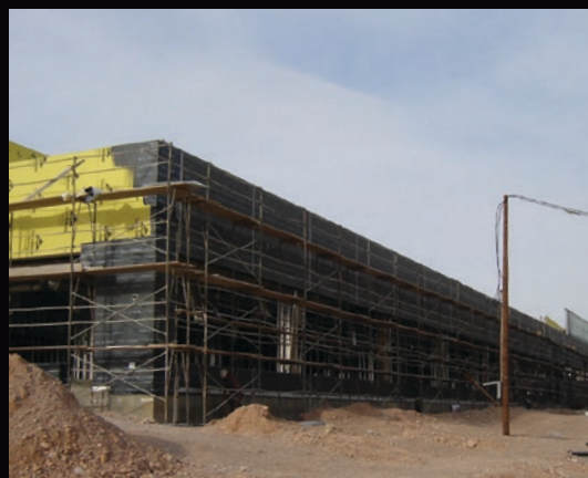
SubSeal offers high strength, high elongation and is flexible to accommodate expansion and contraction of the substrates.