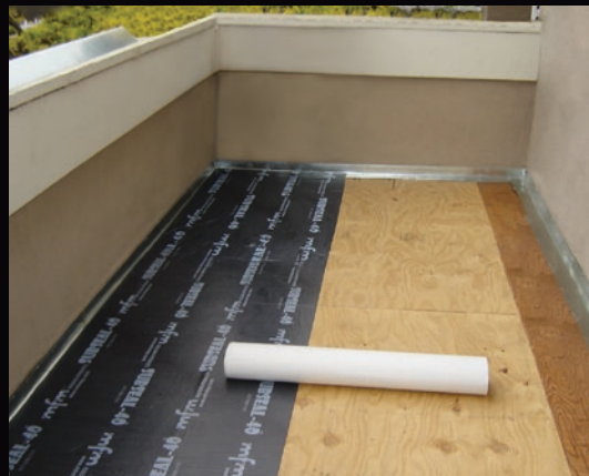
SubSeal is an excellent choice for waterproofing balcony decks and other surfaces that will be finished with concrete or tile.

Call one of our professionals today at 800-882-7663 to get your project on the right track.