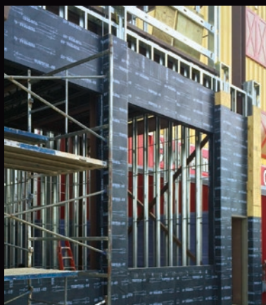
SubSeal is ideal as a through-wall flashing under siding, or exterior plaster and masonry where high moisture content is present.