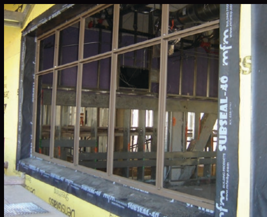
SubSeal bonds aggressively to poured concrete and other building materials. It is fully adhered to the substrate to eliminate movement of water under the membrane.